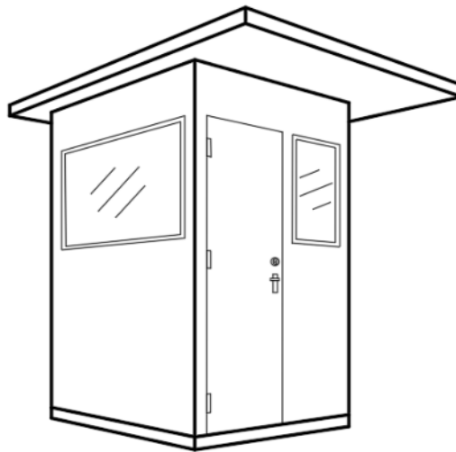
Type B: 1.80 mts x 1.80 mts